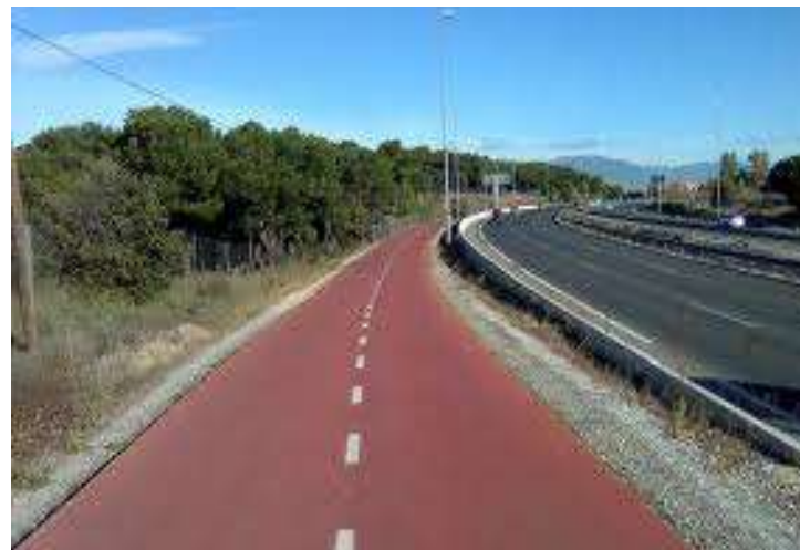
Green Ring in Madrid (Colmenar)