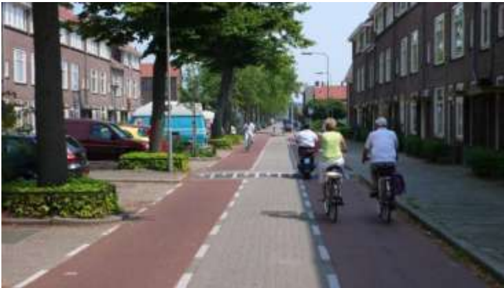
Netherlands (©Jörg Thiemann-Linden)