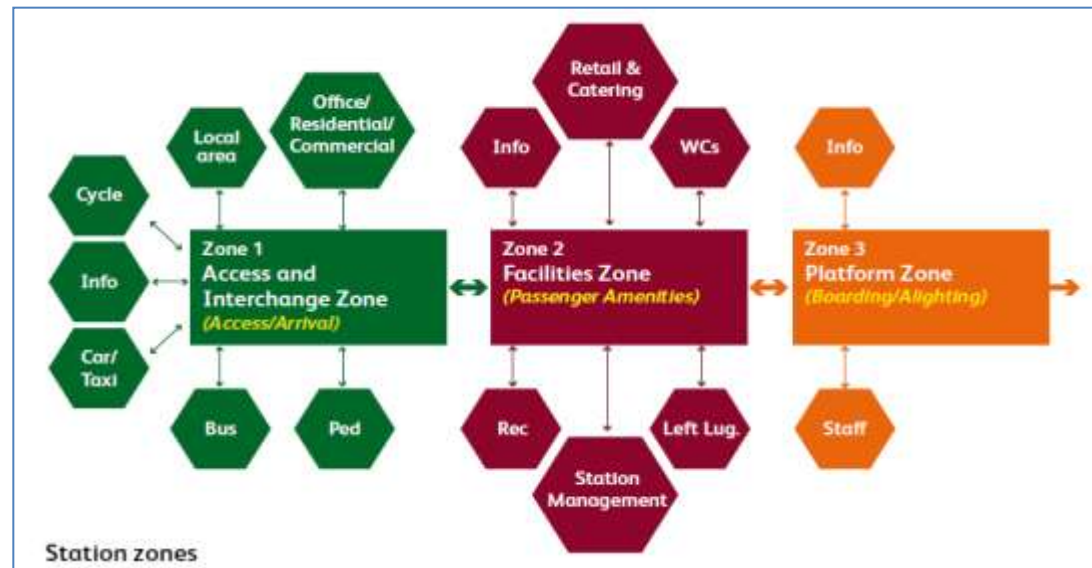
intermodal interchanges scheme