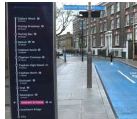
UK