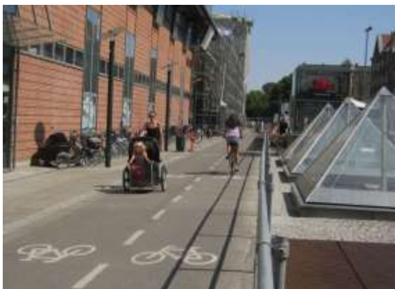
Denmark