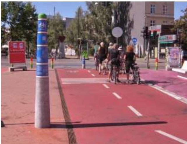
Netherlands (©Dankmar Alrutz)