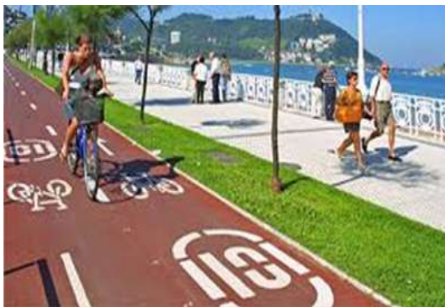
Cycleway in San Sebastián