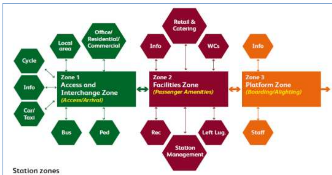
intermodal interchanges scheme