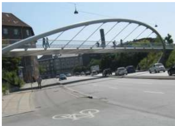
Denmark