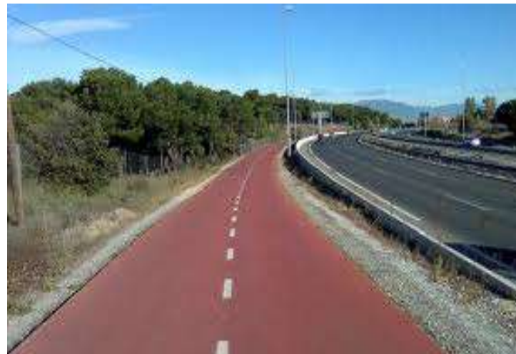
Green Ring in Madrid (Colmenar)