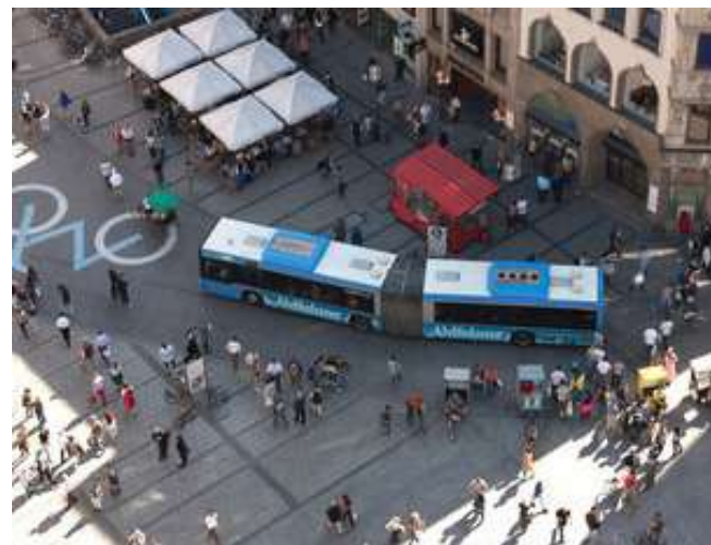
Munich, Germany